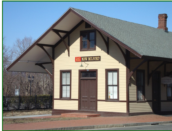
The Greater New Milford Chamber of Commerce office is located in the Railroad Station.