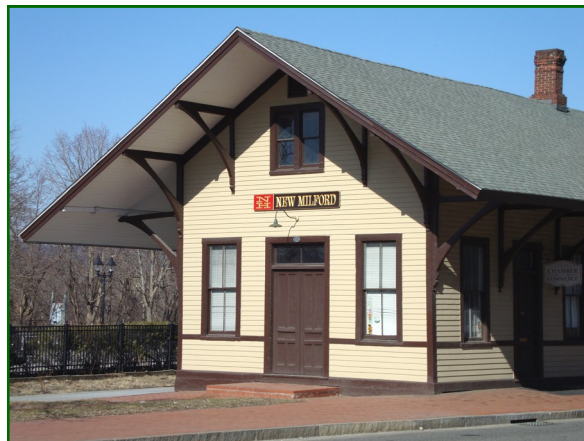
The Greater New Milford Chamber of Commerce office is located in the Railroad Station.