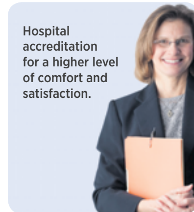
Hospital accreditation for a higher level of comfort and satisfaction.