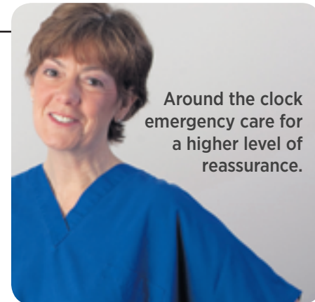
Around the clock emergency care for a higher level of reassurance.