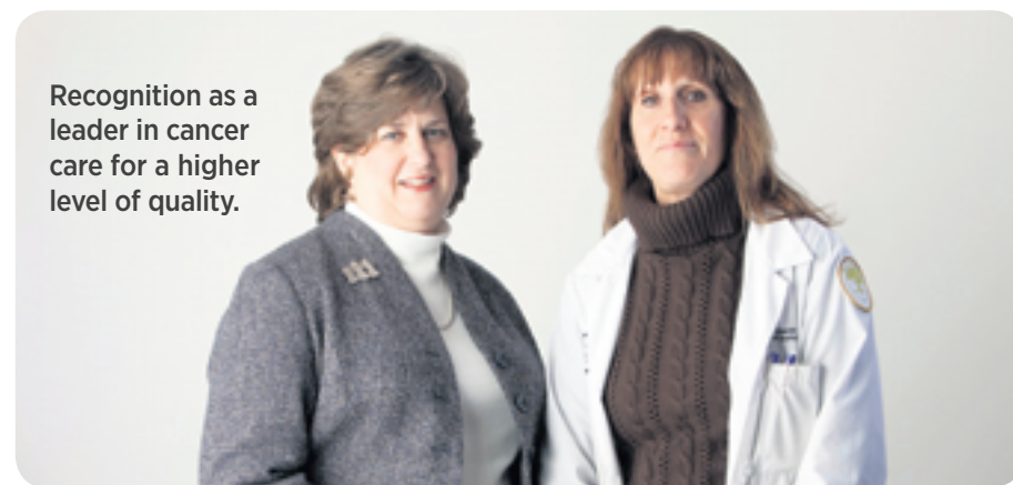
Recognition as a leader in cancer care for a higher level of quality.

Learn how we define a higher level of care. To find a doctor, call 1 800.210.1764 or visit NewMilfordHospital.org