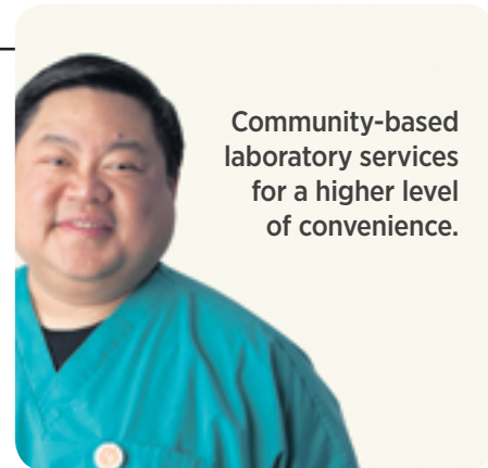
Community-based laboratory services for a higher level of convenience.

Precision Pool & Aquatics Glenn & Debbie Thorp 147 Danbury Road, Unit 20 New Milford, CT 06776 888-457-7665 precisionpoolandaquatics@earthlink.net www.precisionpoolandaquatics.com